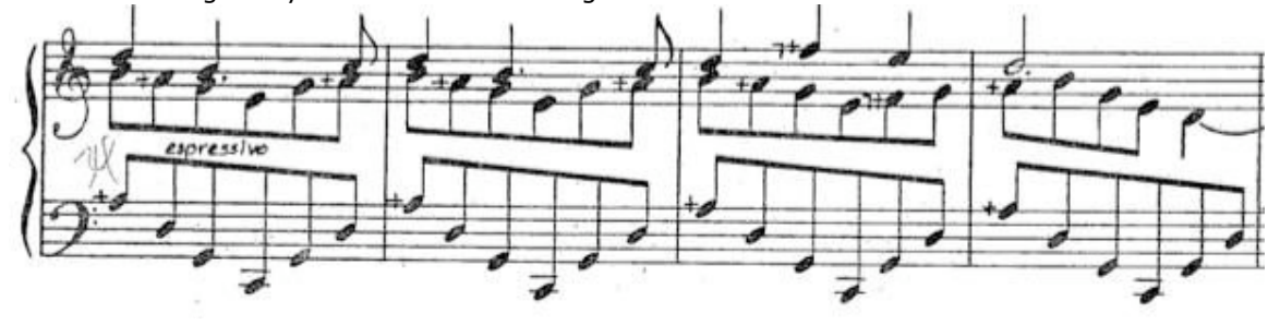
Figure 10: Johnston, Suite for Microtonal Piano, mov.4, mm.35-38

The transition then settles into a drone on C, above which all pitches are harmonics. The middle section is a more relaxed episode in G mixolydian, over an arpeggiation of three of the five available perfect fifths (the largest chain of perfect fifths available in the scale, in fact), and with a delightfully flat seventh scale degree: