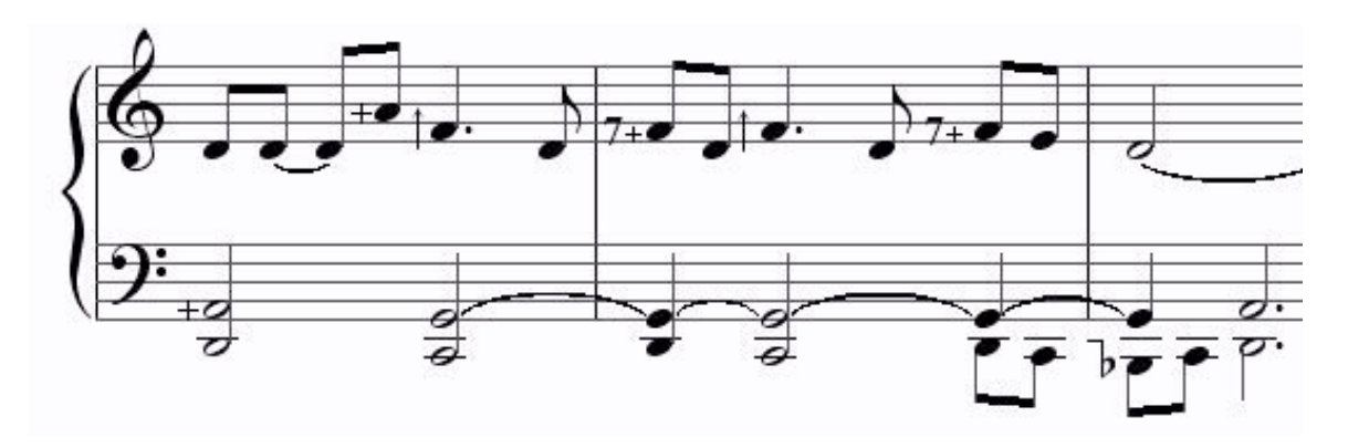
Figure 3: Johnston, Suite for Microtonal Piano, mov.2, mm.14-16

The D-G-F7+ chord gives a frequency ratio set of 3:4:14; the C-G-F \uparrow chord of 2:3:11. Were one to reverse the F7+ and F \uparrow , the results would be D-G-F \uparrow (9:12:44) and C-G-F7+ (4:6:21), requiring higher numbers and therefore more dissonant. More simply put, F7+ is the 7<sup>th</sup> harmonic of G, and more closely related than it is to C, and F \uparrow is the 11<sup>th</sup> harmonic of C, whereas it is 11/6 above G. In each case Johnston uses the F in the harmonic series of the root, or lower in the harmonic series.