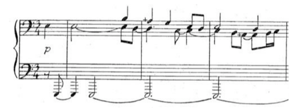
Figure 8: Johnston, Suite for Microtonal Piano, mov.4, opening

Like the one on D, this mode offers perfect fifths on the flatted seventh and sixth scale degrees, but adds a chromatic perfect fifth below the Neapolitan scale step, of which Johnston will make use. Here, there is neither a consonant dominant nor subdominant triad. In fact, one of the determinants of the counterpoint is that the A+ is a wolf dissonance with the tonic E, but consonant with D. Of the 13 A+'s used in the first 15 measures, 11 are sounded either with or immediately before or after a D, one is a quick passing tone and the other a neighbor note. The first two can be seen here: