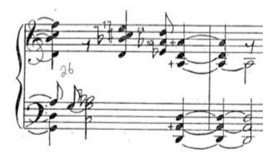
Figure 4: Johnston, Suite for Microtonal Piano, mov.2, mm.26-27

Later the 'Blues' does become considerably more dissonant, but there remains a tendency to contrast thicker chords on C or G with the comparative clarity of simpler chords on the tonic D. Here, a virtual harmonic series on C, containing the 3rd, 5th, 7th, 9th, and 17th harmonics, and then the 13th and 19th, resolving to a spare fifth on D (mm. 26-27):