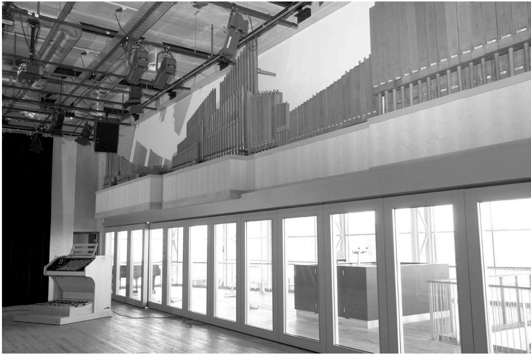
The newly restored Fokker organ in its new location in the BAM-Zaal of the Muziekgebouw aan t'IJ, Amsterdam (above); and a close-up of its keyboard (below).